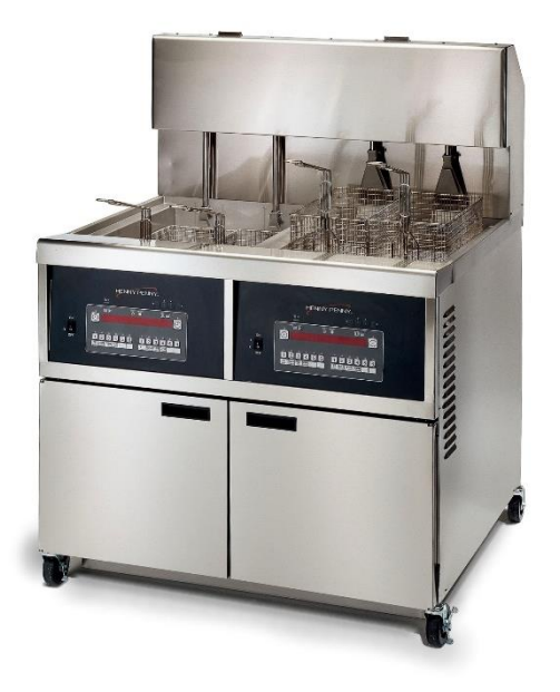
OEA 342 2-well large capacity auto lift electric open fryer

OEA 341 1-well electric OEA 342 2-well electric