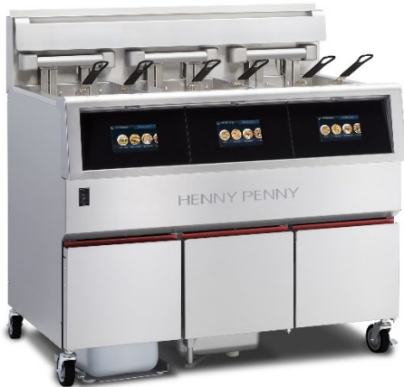
OFE 513 3-well open fryer

The Henny Penny F5 open fryer is designed from the ground up to make frying high-quality food easier, safer and more efficient for any kitchen.